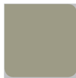
COVE™ SA = 0.54. BCA = M