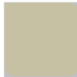
EVENING HAZE® SA = 0.43. BCA = M