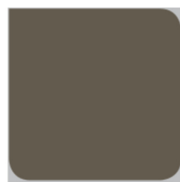
JASPER® SA = 0.68. BCA = D