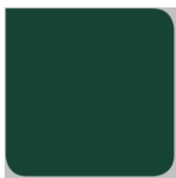
COTTAGE GREEN® SA = 0.75. BCA = D