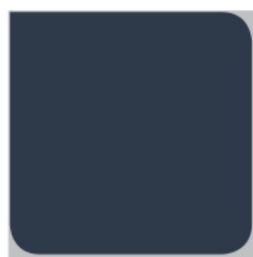
IRONSTONE® SA = 0.74. BCA = D