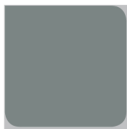
WINDSPRAY®①② SA = 0.58. BCA = M