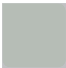
SHALE GREY™ SA = 0.43. BCA = M