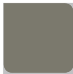
GULLY™ SA = 0.63. BCA = D